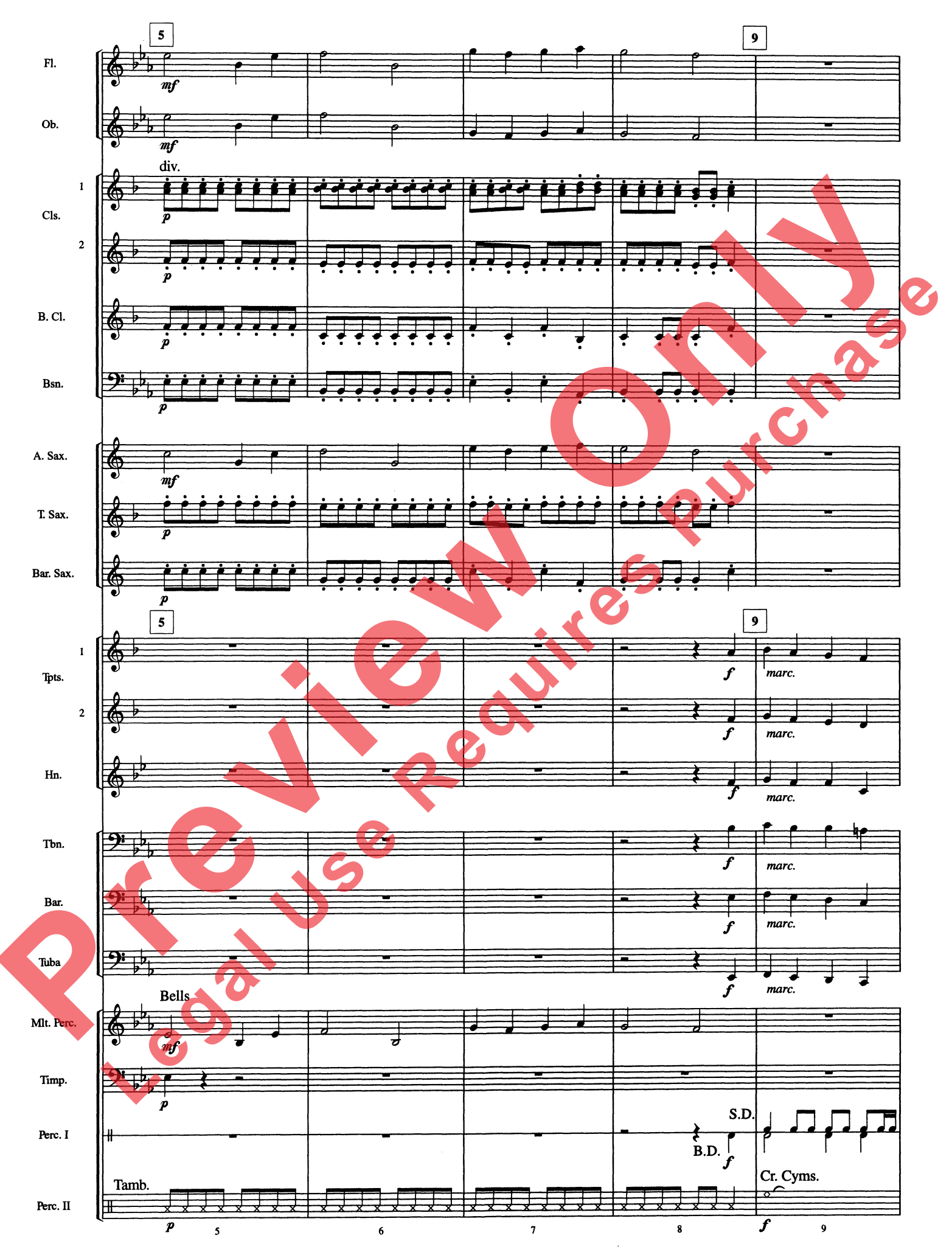
Conductor - 2