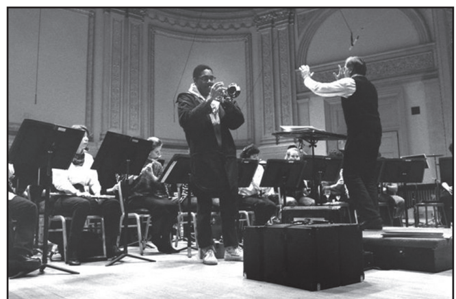
Wynton and the EWE in rehearsal in Carnegie Hall, March 22, 1987