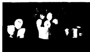
Cover art: Still Life with Lemons, Oranges and a Rose by Francisco de Zurbarán (Spanish, 1598–1664). Oil on canvas, 1633. The Norton Simon Foundation, Pasadena, California

Copyright © MCMXCII by Alfred Publishing Co., Inc. All rights reserved. Printed in USA