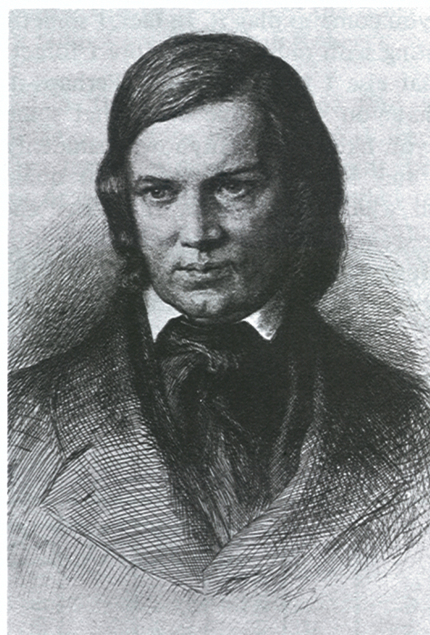
Robert Schumann, Etching by L. Michalek.