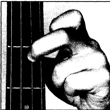
▲ WRONG Finger is too far from fret; sound is "buzzy" and unclear.

If you have difficulty making a clear sound when playing the note F using the 3rd finger, try adding the 4th finger until you build up the strength of your third finger.