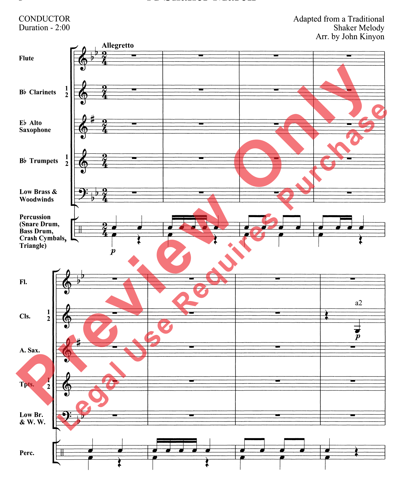
Copyright © MCMXCVII by Alfred Publishing Co., Inc. All rights reserved. Printed in USA.