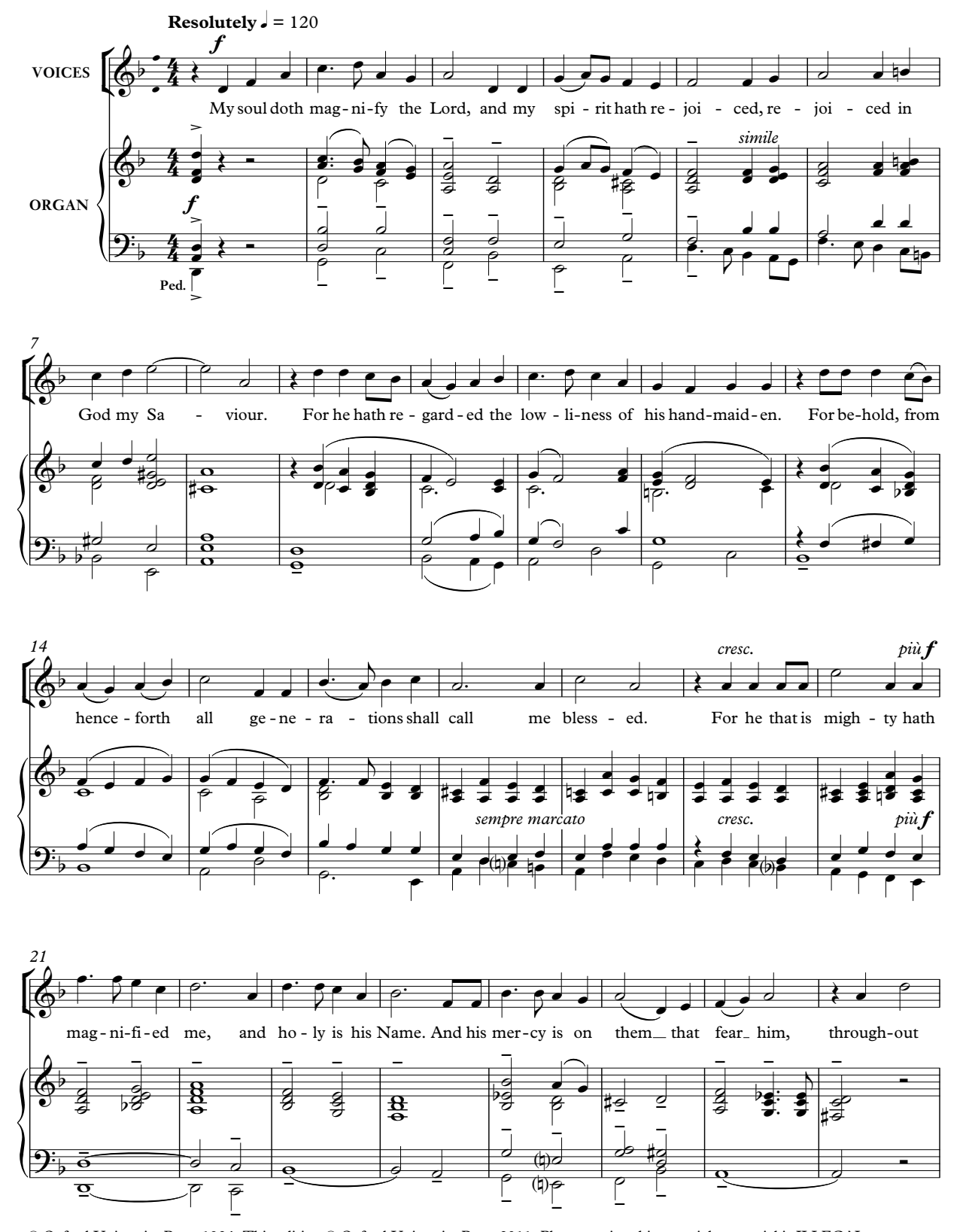
@ Oxford \ University \ Press \ 1924. \ This \ edition \ @ Oxford \ University \ Press \ 2011. \ Photocopying \ this \ copyright \ material \ is \ ILLEGAL.