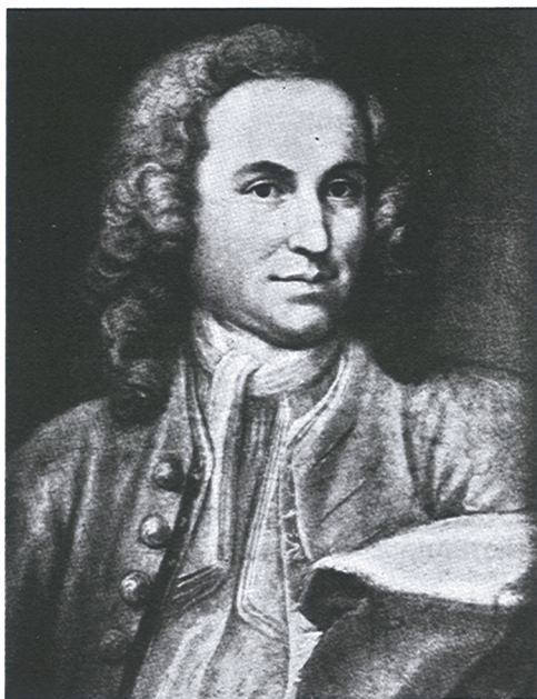
The Young J. S. Bach (Portrait by J. E. Rentsch the elder)